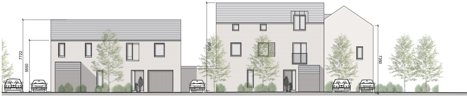
EAST ELEVATION SCALE 1:200