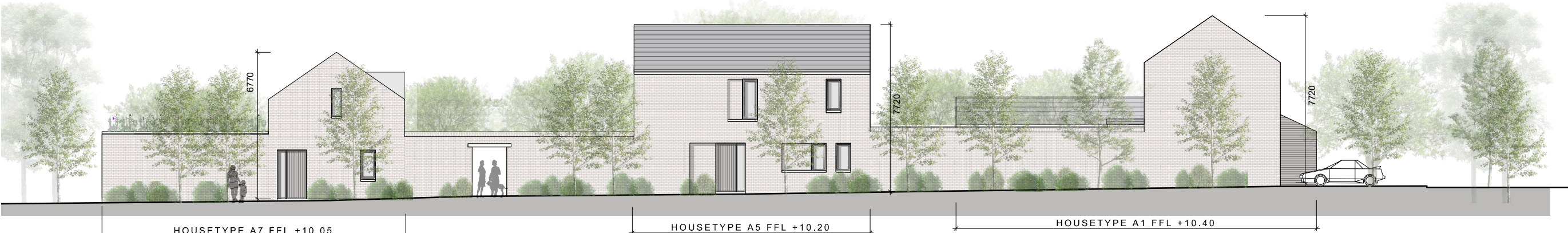
SOUTH ELEVATION SCALE 1:200

Front threshold zone: Shrub and/or tree planting.