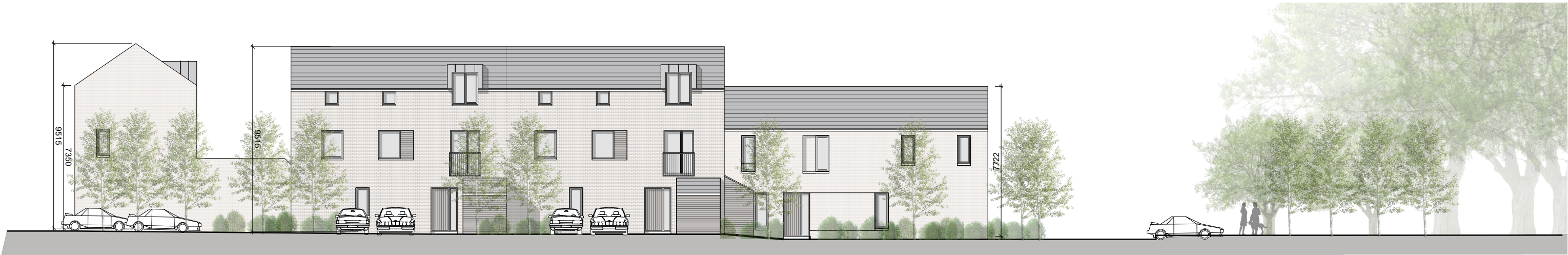
NORTH ELEVATION SCALE 1:200