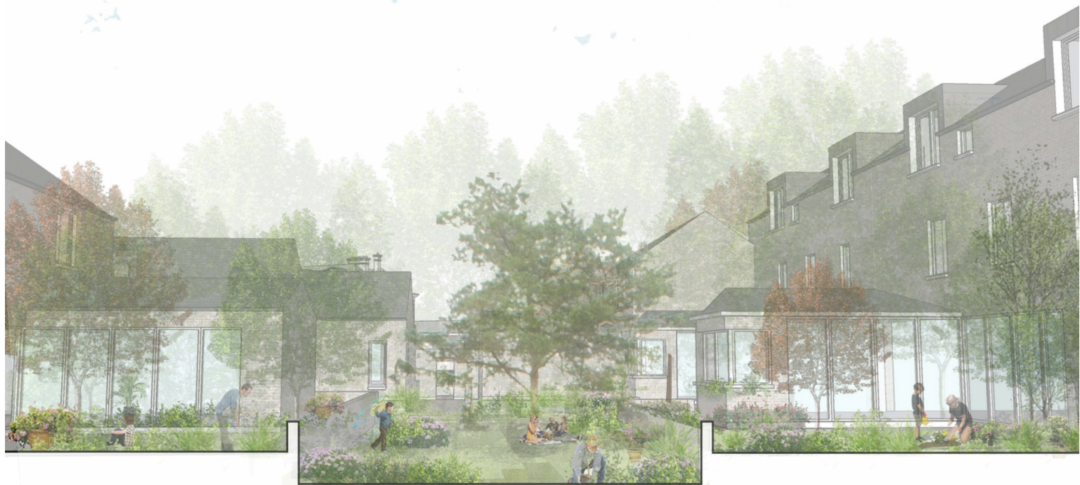
RENDERED PERSPECTIVE SECTION DEMONSTRATING THE CHARACTER OF THE COURTYARD CLUSTER NOTE: NOT TO SCALE